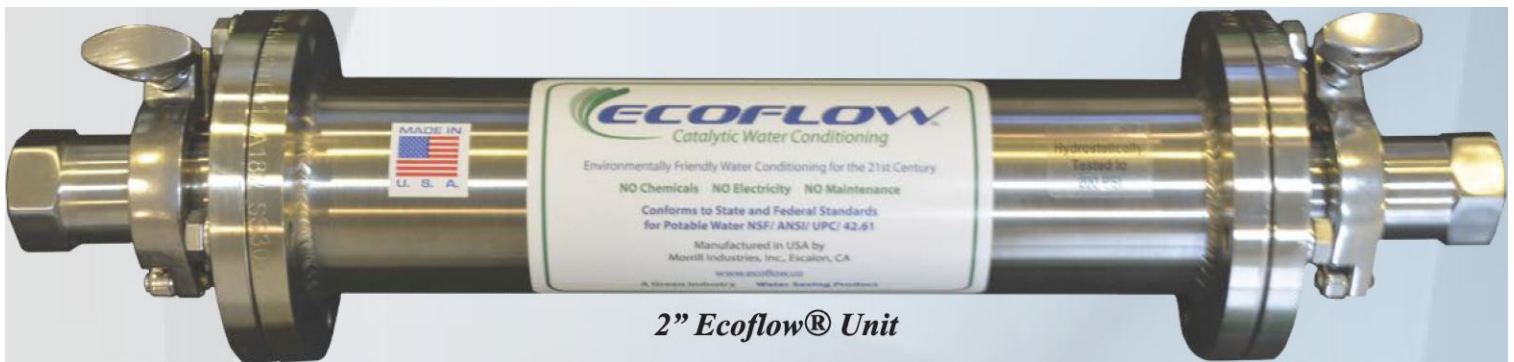
2" Ecoflow® Unit

The Ecoflow® Unit has gone through years of scientific studies and R&D to bring you the product we offer you today.